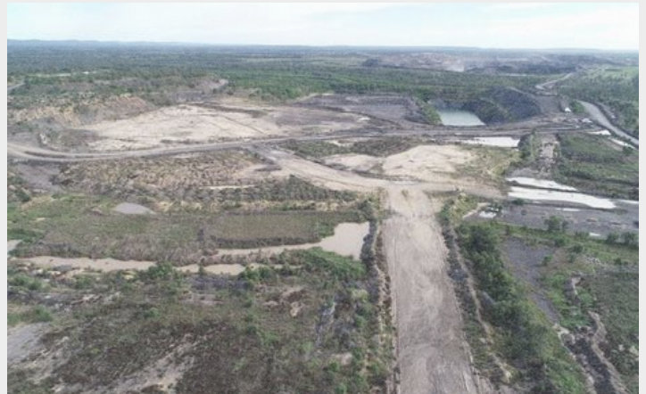
26 October 2022