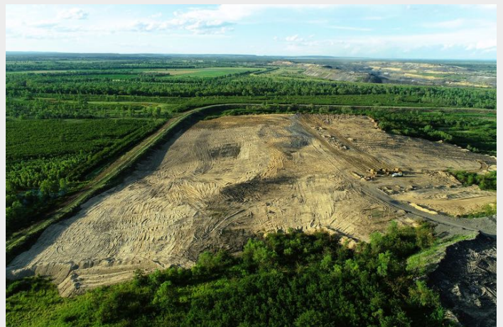
15 December 2022