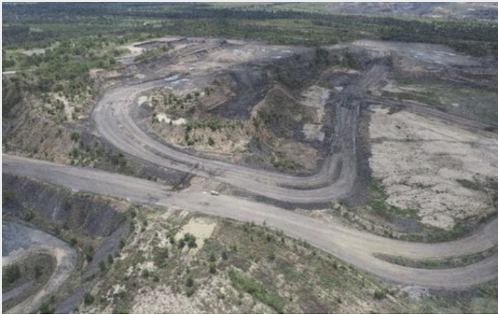
31 May 2022

All of these activities are important steps in returning the land to the post-mining land use of grazing. Grazing is the most appropriate post-mining land use given the surrounding land uses, the topography and the soils present on the site. Careful planning of the rehabilitation strategy and design was needed to facilitate a post-mining land use of grazing. The maximum targeted slope angle for any of the batters on the final landform will be 10% with much of the landform at shallower gradients. The surface water management features incorporated in the final landform will result in very little need for ongoing maintenance. The final important element of the design work was selecting a species mix to support grazing. A mixture of native and improved pasture species will be planted. They will enable groundcover to establish quickly which will limit erosion potential before these early grasses die off and add vital organic matter to the soil. This will pave the way for the successful establishment of the species that will support sustainable grazing on the land for the years to come.