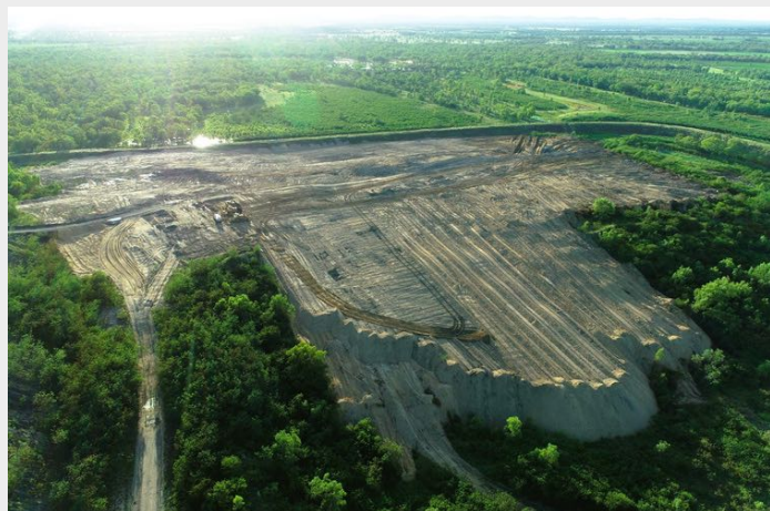
15 December 2022