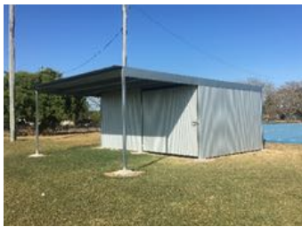
Baralaba Junior Rugby League Shed