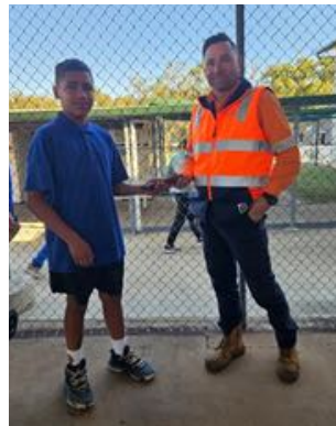
Baralaba State School NAIDOC Week